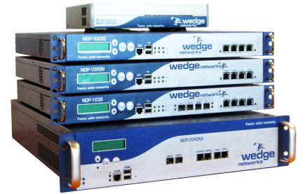
BeSecure Web Security Appliance Family

provides high performance network based Web security solutions to enterprises and service providers worldwide. Our technology leadership in deep content inspection allows organizations to protect against new and emerging threats that traditional scanning methods have difficulty intercepting and controlling.